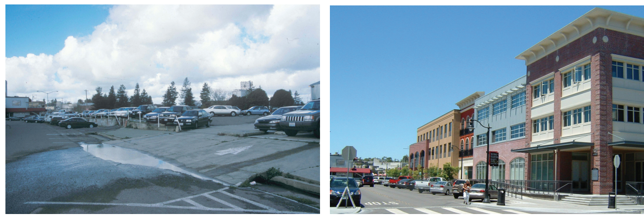
1st Street looking north (before 🕉 after)