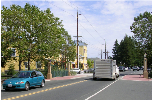
Bridge over Cotati Creek (before & after)