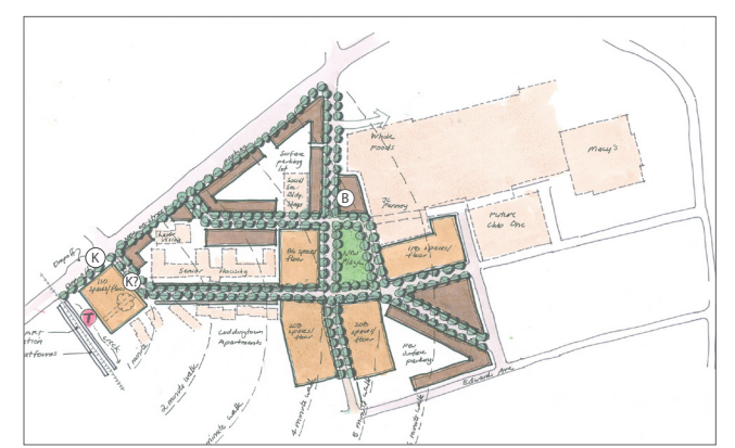
Concept sketch showing options for connector street and plaza locations

Sonoma and Marin counties in California voted in 2008 to approve a rail system called SMART. This project's goal was to move the second station in Santa Rosa from a location that would have been hard to access by the public to one that was visible and easily accessible. Fisher Town Design provided the inspiration, design, community engagement and political expertise to successfully move the station. Since the proposed station site was already developed, the challenge was to coordinate the public, all of the property owners and to come up with a design that included over 300 parking spaces and a new connector road to meet SMART's needs. Community outreach included workshops, multiple meetings and surveys. This was done with Codding Enterprises and in conjunction with a coalition that included Creative Housing Associates, the Redwood Chapter of the AIA and the Leadership Institute.