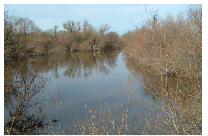
Laguna de Santa Rosa