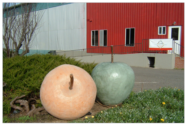
Sebastopol's unique sense of place