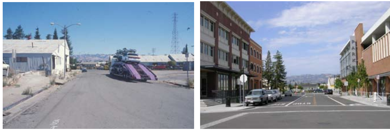
C Street at 1st looking east (before & after)

This master plan and SmartCode (a type of form-based coding) were designed by a team led by Fisher & Hall Urban Design, with Lois Fisher as Director of Design, through a community process during which the Central Petaluma Advisory Committee and other members of the public identified their interests for this area. These included riverand pedestrian-oriented development, a mix of architectural styles, and lively public spaces. Within 2 years of the SmartCode's adoption, over $100 million of new development was entitled, including a riverfront plaza, 200 dwelling units, a 12-screen cinema, a 3-story parking garage and 94,000 sq. ft. of commercial space. The team included Crawford, Multari & Clark Associates, Sargent Town Planning, Siegman & Associates and CharretteCenter.com.