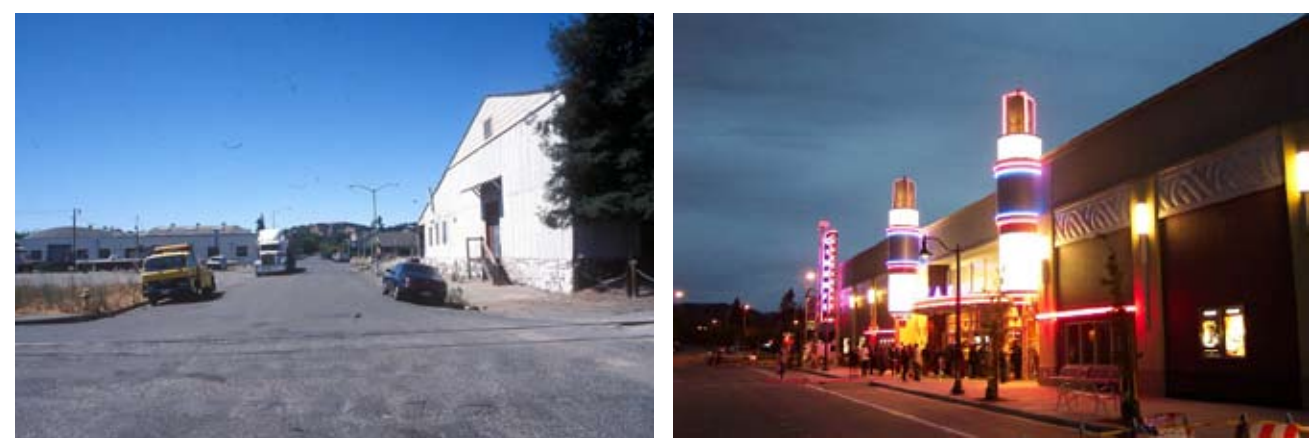
C Street at 1st looking west (before & after)