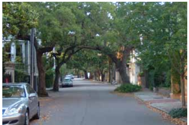
Picturesque Street in Charleston