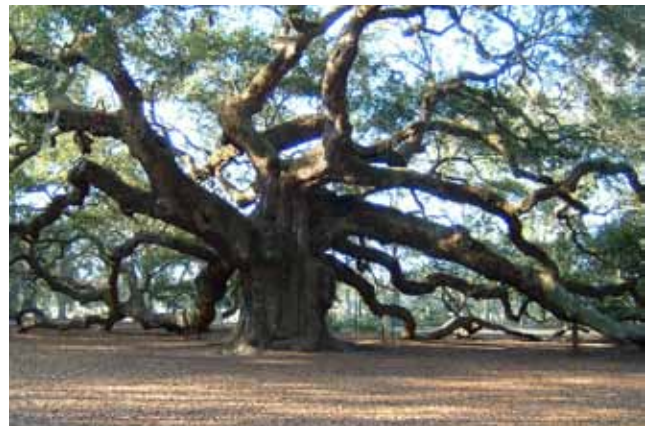
Angel Oak, circa 2007