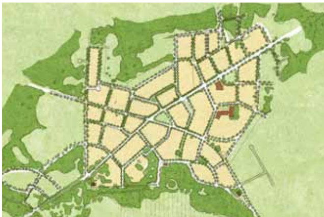
Charrette Plan of the Bohicket Rd. and Maybank Hwy Village

John's Island is a barrier island that is just south of the historic core of Charleston, SC. The island is experiencing growth pressures and the task was to provide for new development to come in the form of compact villages instead of the suburban sprawl. Fisher Town Design was the SmartCode specialist for TPUDC. Fisher Town Design analyzed the existing conditions in the island, assisted in the public workshops, the calibration of the SmartCode and the design of the village at Maybank Hwy. and Bohicket Rd.